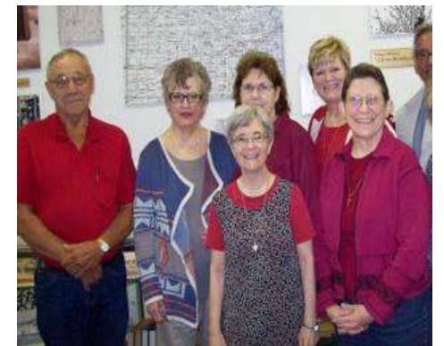
Southeast Kansas Musicians