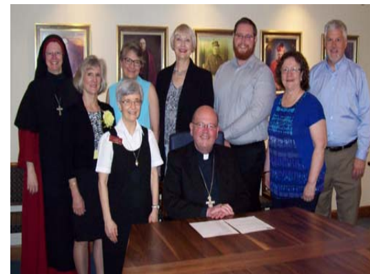
Wichita Chapter Diocese of Wichita, Kansas